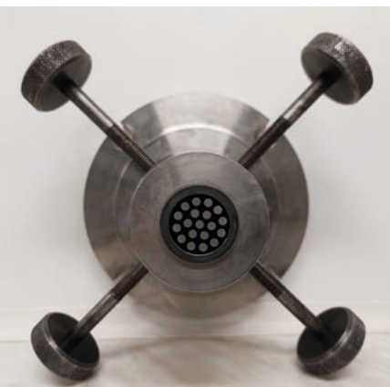
Extrusion tool for the shaping of the green bodies.

The authors would like to thank the German Federal Ministry of Economic Affairs and Climate Action (BMWK) for its funding as part of the “Central Innovation Program for SMEs” (funding no.: ZF4076470SA9).